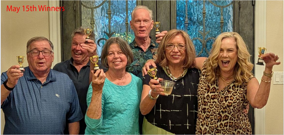
May 15th Winners