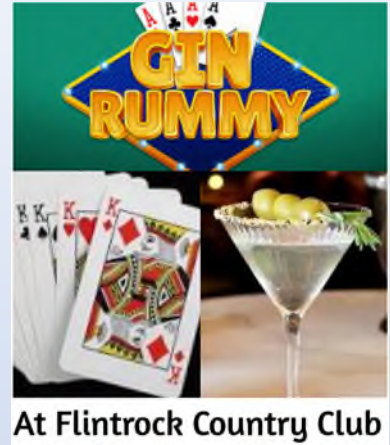
At Flintrock Country Club