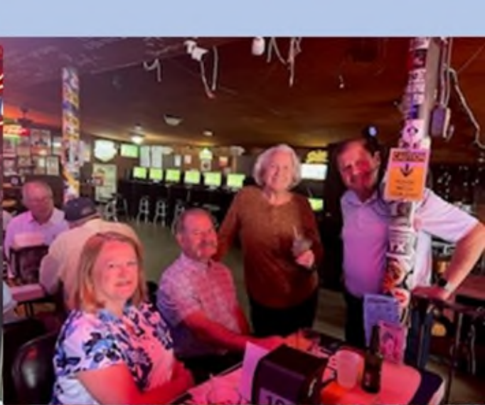
Poodies Roadhouse April 25th