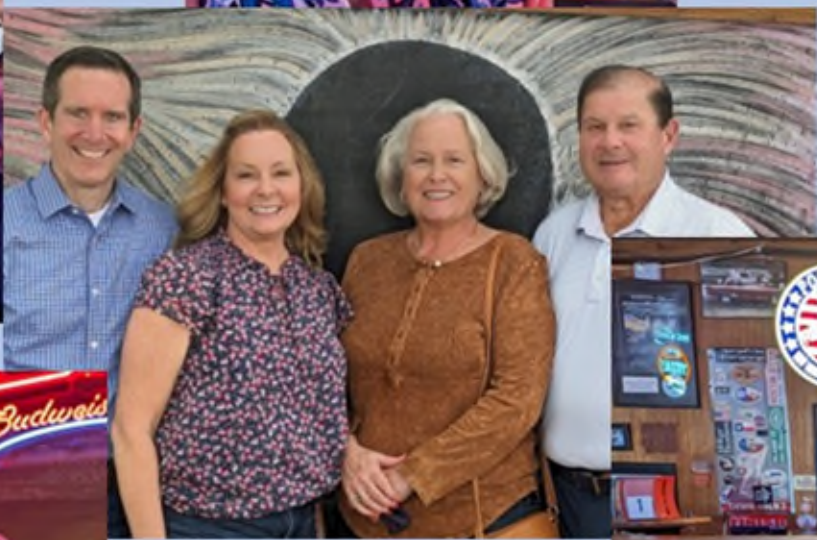
Poodies Roadhouse April 25th