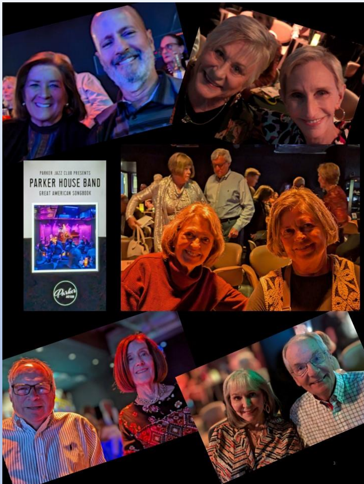
Lakeway Newcomers & Neighbors