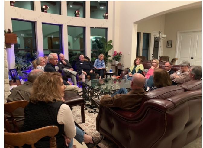
The group's February meeting