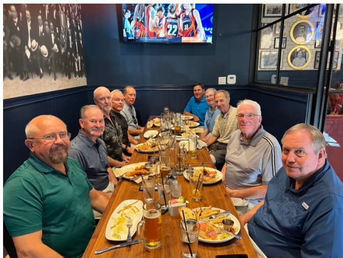
September 20 th event at The League at the Galleria